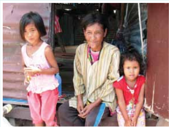
These two sisters were abandoned by their mother and now are cared for by this elderly woman who is not their relative. They now receive care at Blessing Home.

Pattaya, Thailand is an infamous destination for sex tourism and it is the center of child trafficking in Southeast Asia. It is very common for orphans and street children to be sold into sexual slavery or forced into the drug trade. Without Christian love and intervention, many of these children will have their lives ruined by those who would enslave them for their own profit.